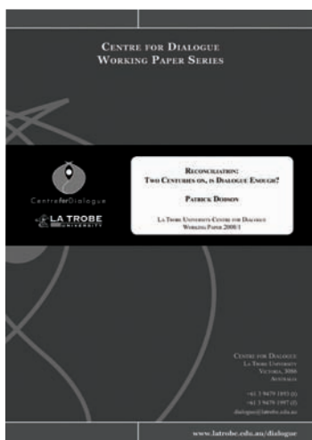
Working Paper by Patrick Dodson

In 2008, the Centre revamped the design of its Working Papers Series. This included the printing of new front and back covers, as well as the reformatting of the papers' contents.