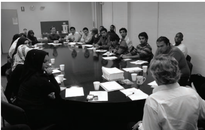
Young Muslim Leaders speaking with La Trobe University's Professor Robert Manne

The programme was researched, prepared and delivered by the Centre for Dialogue in close collaboration with the Islamic Council of Victoria.