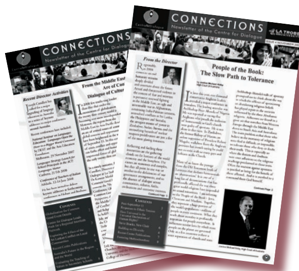
Editions 3 & 4 of Connections .

Some 5000 copies of each edition were printed and disseminated using the Centre's extensive international and national databases.