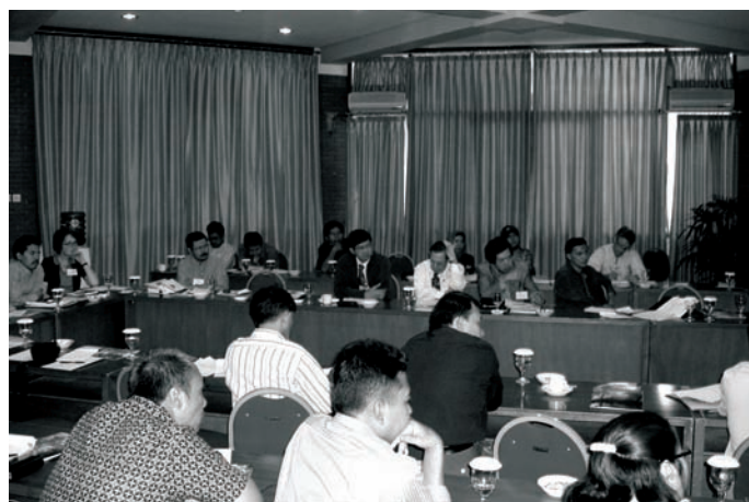
Jakarta Workshop (20-22 October 2008)