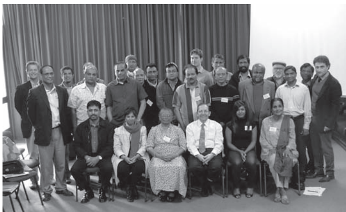
Participants at the final dialogue session, following the issue of the joint statement on the Sri Lanka conflict.

Facilitated by the Centre, the year-long dialogue began with a consultation stage, lasting from December 2007 to May 2008. The information and feedback received during the consultation period played a crucial role in shaping the process, participants and arrangements for the dialogue, and will be critically important to the formulation of research findings.