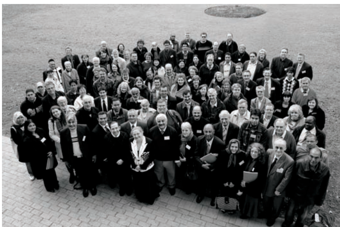
Participants at the Globalisation for the Common Good Conference