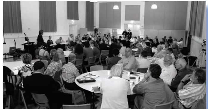
Participants at the Community Consultation at Coburg Civic Centre

ways of better utilisation of energy, resources, knowledge and experience. Issues of social justice, problems confronting newly-arrived migrants, rifts within and between faiths, the challenges and importance of reconciliation, and the need to break down of barriers between communities of faith and the secular community, were reoccurring issues raised throughout the consultancy.