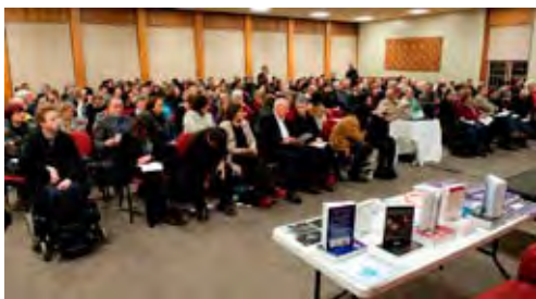
The audience at St Mary's College.