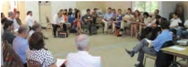
The Cypriot Academic Workshop on Nicosia, Cyprus, July 2010