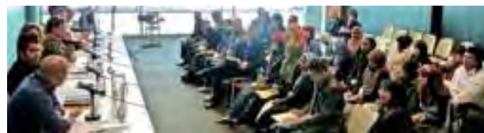
Participants enjoying robust debate with a panel of journalists at the ABC in Sydney.

The programme has now built a core of over 90 young Muslims (22 in South-East Asia) who are leaders in their own communities and who have grown in self-confidence, are psychologically stronger, with experience in debate and dialogue, and with a growing network of contacts that reach across Australia's three major cities and into the region.