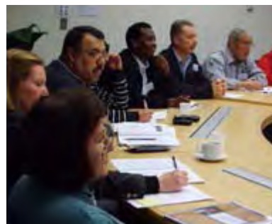
NIIN Interim Steering Committee meeting.