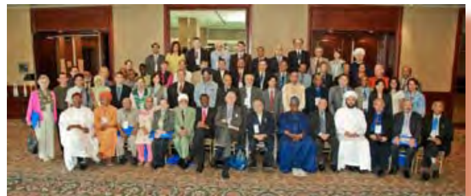
Participants at the Kuala Lumpur Conference.

The consultation was also of the view that the draft universal declaration of human responsibilities proposed by the Interaction Council (made up of former heads of government and heads of state) which espouses core values common to all religions should be introduced to the UN General Assembly for debate and adoption. It should stand beside the universal declaration of human rights of 1948 as a statement of high principle. Conventions emanating from the universal declaration of human responsibilities would be open for ratification by UN member states and would have the force of law.